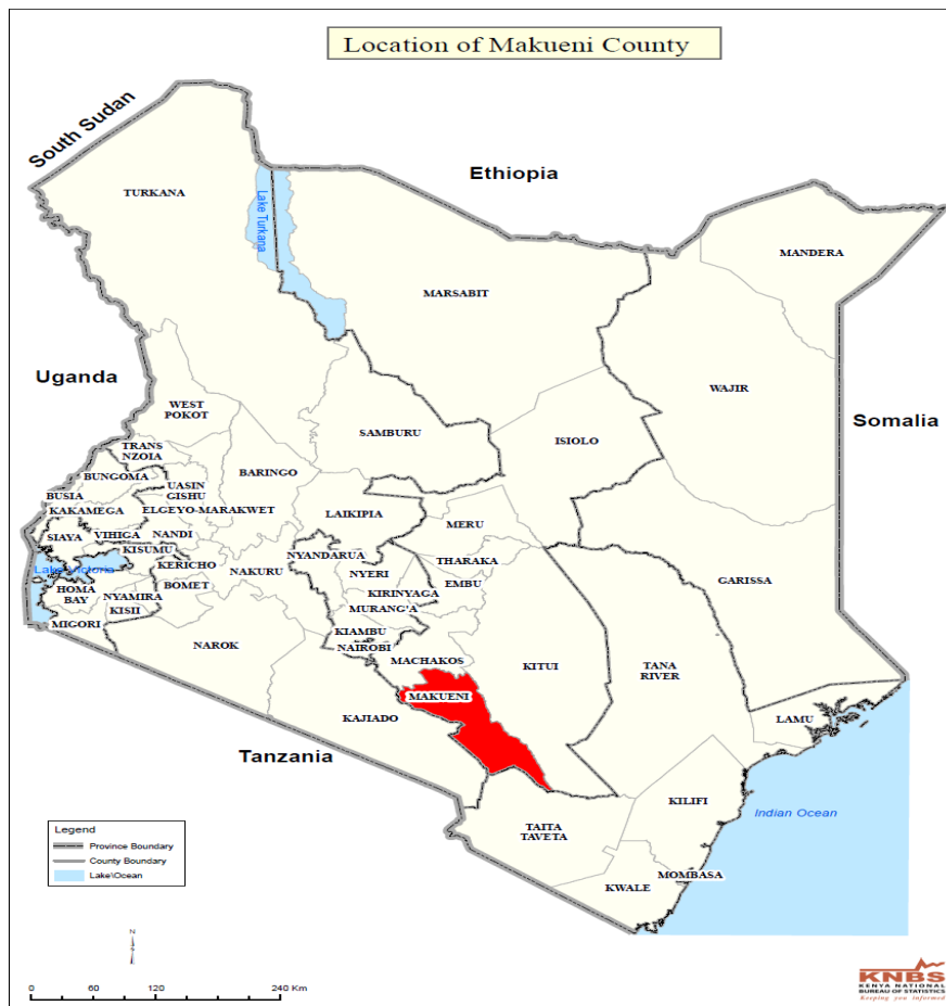
Map 1: Location of the County in Kenya